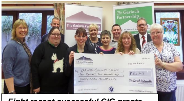
Eight recent successful CIG grants

This small grants scheme was introduced in 2012/13, utilising the underspend in the partnership's budget caused by the delayed appointment of the development worker, and topped up in the year 2013/14 by £5k from the Garioch Area Committee's Area Budget. In 2014/15 the Area Committee agreed to provide £10k to the partnership to continue the scheme.