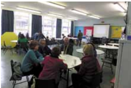
Residents at Port Pancakes consultation event.

Within the consultation, we spoke to numerous groups, people and went to some of the school events. The specific actions come from all of these groups, and then were prioritised at an event at the school.