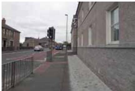
Bus and pedestrian crossing.

There is a real lack of shops in Port Elphinstone, so access to affordable, fresh and healthy food is limited without having to travel into Inverurie.