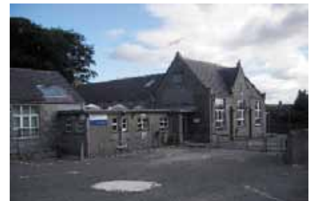
Port Elphinstone School as it is today.