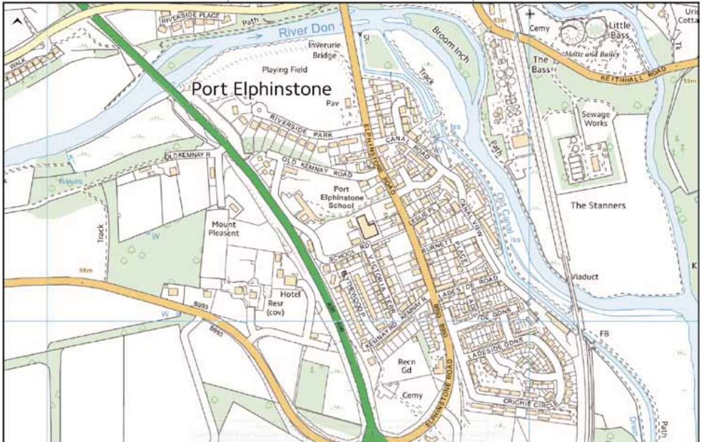
0 375 metres Map Scale 1:5266