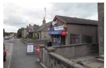
Port paper shop.