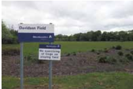
Davidson Field Park.