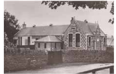
An old photo of Port Elphinstone Public School.

To kick off the process The Garioch Partnership rented an office that had become available in Port Elphinstone Community House (PECH) for a period of six months. Staff from both organisations then set up a series of meetings with local user groups in the Community House and held discussions with them on what they liked about living in Port Elphinstone, what could be better and what changes they might like to see.