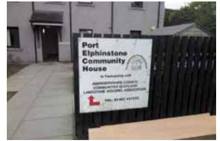
Port Elphinstone Community House sign.

The lunch club runs once per week during school term time, as lunch is provided via the school dinners service, at a small cost, for the members of the club. Ages range from retirement up to 100+ and the club aims to keep people as active members of their community.