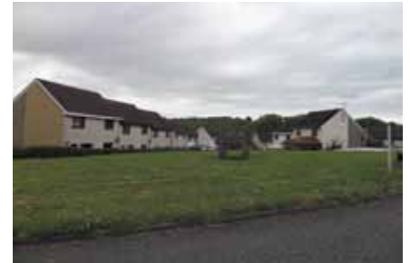
Port housing styles.

The closing of the JG Ross shop that was demolished to build the flats has been an issue, leaving people having to travel some distance to buy basic shopping. The paper shop was highly praised for staying open, but there is a real need for something local. A local working ATM (bank machine) was flagged as important.