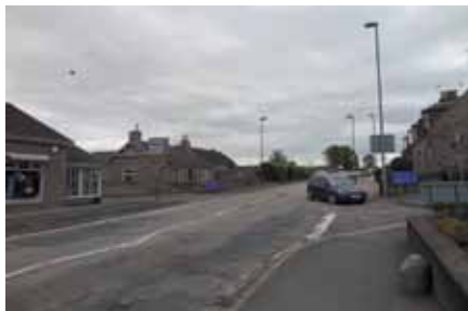
Ladeside/Kemnay road junction.