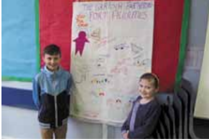
Local children getting involved.

One of the locals prompted the project title of “Port Priorities” A Facebook page for the consultation was also set up and this, plus contacts for the consultation, was publicised in public places in Port Elphinstone.