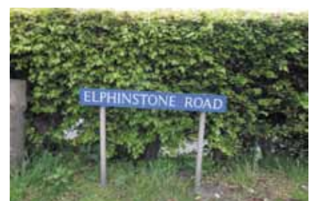
Port Elphinstone sign.