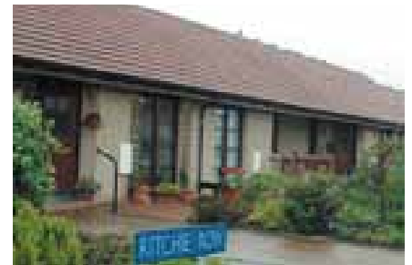
Port housing styles.