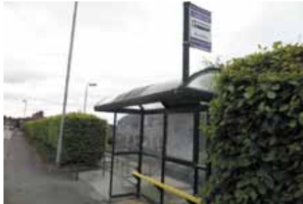
Elphinstone Road bus stop.